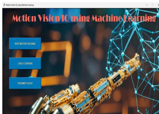
Figure 2: Home Page

Advances in motion vision intelligence have shown promising outcomes by utilizing diverse datasets of motion information to train models. This strategy enables more accurate recognition of intricate actions and behaviours. Additionally, the refinement of specialized deep learning architectures has paved the way for real-time application of these motion vision capabilities. These developments have led to improved analysis of dynamic visual data, benefiting areas like robotics, video surveillance, and human-computer interaction.