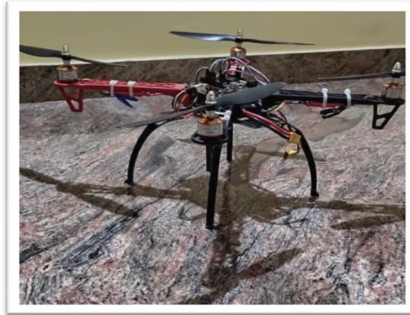
Fig 3.It is becoming more efficiency by improving navigation system, battery life and safety features.