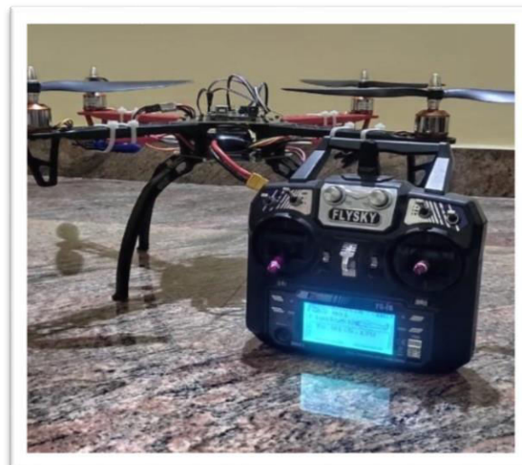
Fig 2.Drone delivery system used to transport packages, food, medical supplies and other kind of goods to consumers.