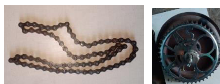
Fig. 5 – Chain & sprocket

Chain & sprocket: The type of chain drive most frequently used for mechanical power transmission on a variety of home, industrial and agricultural machinery, including conveyors, wire- and tube-drawing machines, printing presses, cars, motorcycles and bicycles, is roller chain or bush roller chain. It is made up of several short cylindrical rollers connected by side links. It is propelled by a sprocket, a wheel with teeth. It is a straightforward, dependable, and effective method of transmitting power. Tensile strength is the most popular way to assess the toughness of roller chains. A chain's tensile strength indicates how much strain it can sustain before bending under a single load. The fatigue strength of a chain is as crucial to tensile strength