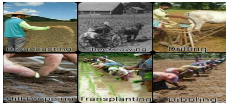
Fig. 2 – seed metering and dropping mechanism

6. Check row planting: This kind of planting calls for uniform distances between rows and plants. This method ensures that seeds are placed correctly along straight, parallel furrows. Every time, the rows run parallel to one another. The tool used for check row planting is called a check row planter. For our project, we have decided to use the dribbling method out of the aforementioned techniques.