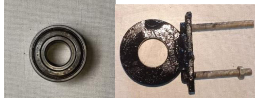
Fig.9 - Bearing and bearing holder

Plough: A plough is a farm instrument used to turn or soften the soil before to planting or spreading seeds. Traditionally, horses and oxen pulled the plough. A blade linked to a wooden, iron, or steel frame is what a plough uses to cut and loosen dirt. It has been essential to farming for the majority of time. Ploughs are primarily used to turn over the top soil, bringing new nutrients to the surface while burying weeds and crop residue for later decomposition. Made of 10 mm MS round rod, and length 250 mm.