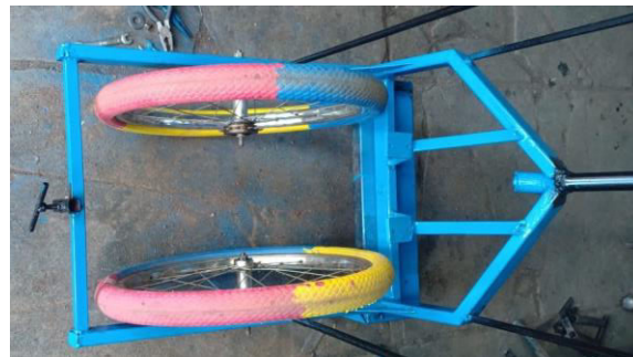
Fig.6 - Ground Wheel

Ground Wheel: A pair of idler wheels on either side aid in the precise adjustment of seed placing depth while the ground wheel supplies the necessary power for the seed metering mechanism to function. To raise and lower the ground wheel during turns, a lever mechanism is also available. The tool is easily towed by a pair of bullocks. Mild steel is used for the grinding wheel. The seed metering mechanism and ground wheel are connected and are located at the box's base. Seed metering is the process that extracts seeds from the seed box and places them in the seed tube.