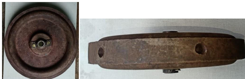
Fig.8 - Seed Dispenser wheel

Seed Dispenser wheel: An agricultural tool called a seed dispenser is used to plant seeds for crops by placing them in the ground and burying them to a predetermined depth. This guarantees that seeds will be dispersed uniformly. Seed dispenser wheel dia 205 mm, thickness 40 mm with 6 holes of dia 15 mm for accommodating seeds (ground nut seed).