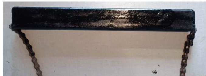
Fig.11 - Leveller

Leveller: Leveller is a device attached at the rear end of the machine, which is used to level the soil which ploughed after sowing the seed into it. It is just dragged on the ground, above the soil. Made up of a 32 mm square pipe, fitted with a cycle chain and fastened to main chassis.