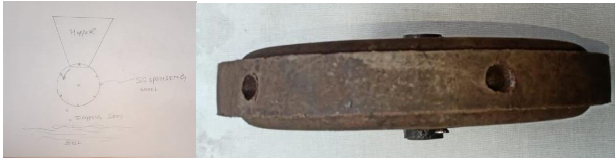
Fig. 3 – seed metering and dropping mechanism