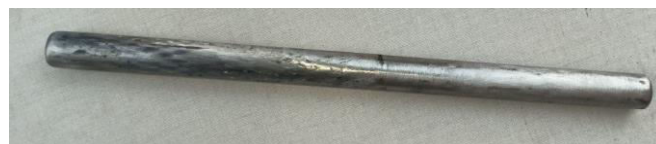
Fig. 4 – Main shaft

Material of shaft: When high strength is required, an alloy steel such as nickel, nickel-chromium or chromium-vanadium steel is used. Shafts are generally formed by hot rolling and finished to size by cold drawing or turning and grinding. Dia 12 mm, length 250 mm.