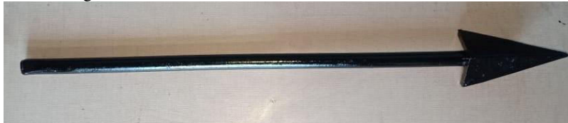
Fig.10 - Plough

Plough: A plough is a farm instrument used to turn or soften the soil before to planting or spreading seeds. Traditionally, horses and oxen pulled the plough. A blade linked to a wooden, iron, or steel frame is what a plough uses to cut and loosen dirt. It has been essential to farming for the majority of time. Ploughs are primarily used to turn over the top soil, bringing new nutrients to the surface while burying weeds and crop residue for later decomposition. Made of 10 mm MS round rod, and length 250 mm.