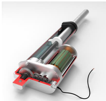
Fig 2. Linear Actuator

A linear actuator actuates, or moves, in a linear straight line. Though the basic function of an actuator is the same, there are different ways that motion is achieved. The uses of linear actuators include wheelchair ramps to toys and technological instruments for spacecraft. The working principle of a buzzer depends on the theory that, once the voltage is given across a piezoelectric material, then a pressure difference is produced. A piezo type includes piezo crystals among two conductors.