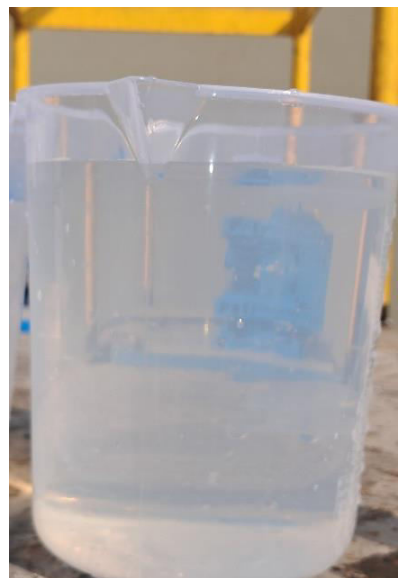
Fig. No. 4. After DAF System

Using Polyacrylamide (PAM) in a Dissolved Air Flotation (DAF) system for PVC/CPVC plant wastewater treatment can lead to the following results: