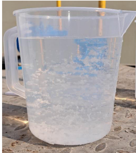
Fig. No. 3. After chemical Dosing