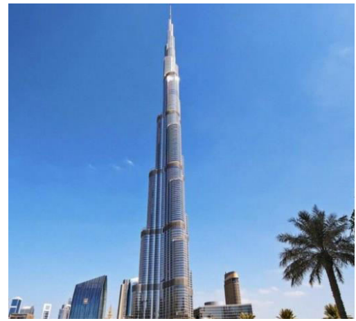
Fig. 4 Typical engineering case (a) The Hong Kong-Zhuhai-Macao Bridge in China (b) The Burj Khalifa in Dubai