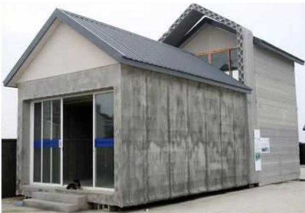
Fig. 1 The 3D-printed house constructed in Qingpu, Shanghai

are becoming increasingly prevalent in the civil engineering industry. Traditional teaching content and methods may not adequately reflect these changes, making it difficult for students to meet the demands of modern engineering practice. Therefore, it is necessary to incorporate the latest industry developments and technologies into the curriculum. This can be achieved by inviting industry experts to deliver lectures or special reports, sharing the latest construction technologies and practical experiences to cultivate students' sensitivity to new technologies and their application capabilities, thereby sparking their interest in future technologies. Additionally, collaboration with construction companies can provide insights into industry needs and the latest trends, enabling timely adjustments to teaching content. It is also essential to emphasize the importance of construction standards to students, as these standards form the basis for quality control and acceptance in civil engineering projects. During lectures, instructors should consciously develop students' ability to learn and apply new standards, ensuring they are well-prepared to adhere to and implement these standards in their future careers. 3D printing technologies, 3D laser scanning technologies and green construction techniques are shown in Figure 1 to Figure 3, respectively.