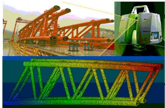
Fig. 2 The 3D scanning of the Wujiang Bridge in Deyu, Guizhou