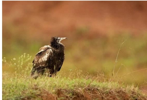
Fig 2: A Juvenile Egyptian Vulture

The home range of the fledglings generally expanded incrementally with maturity. The juveniles occasionally exhibited adult conduct. On one case, the elder fledgling of a double brood nourished other with a small morsel of food retrieved from the nest. Resident fledglings exhibited aggressive behavior towards intruding adult, immature, and fledgling Egyptian vultures. The attacks consistently occurred when the intruder was situated adjacent to the fledglings. The fledglings refrained from assaulting encroaching Egyptian vultures in flight, likely due to their inferior flying abilities compared to the intruders.