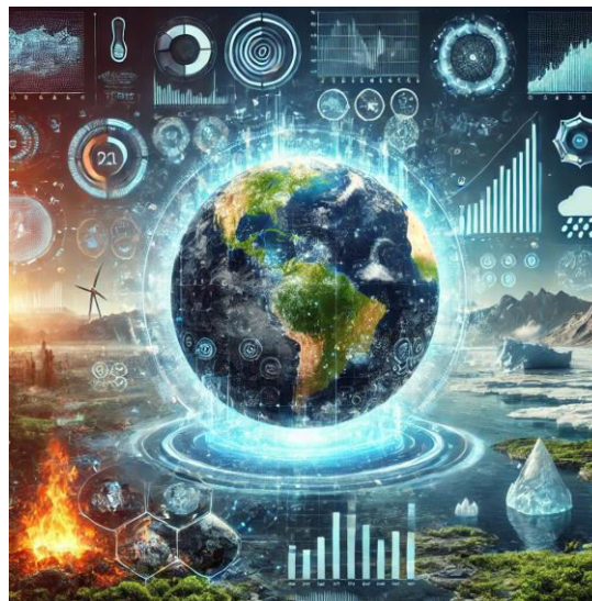
Fig.1 Climate Change Prediction along with AI

AI techniques have significantly enhanced the capability of climate prediction systems by leveraging various methods to analyze data, recognize patterns, and model complex environmental systems(Fig 1). These methods include Machine Learning (ML), Deep Learning (DL), Reinforcement Learning (RL), and Natural Language Processing (NLP). Here is a detailed explanation of their applications in climate science.