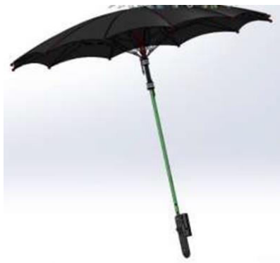
Figure 4. Smart umbrella 3D design (side view)