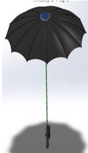
Figure 3. Smart umbrella 3D design (top view)