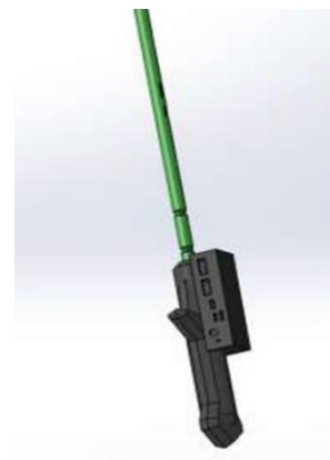
Figure 5. Smart umbrella 3D design (close- up handle)

The proposed multifunctional umbrella is considered a functional, innovative, and competitive design that provides an intelligent solution. It allows users to take advantage of the high temperatures in Mérida, Yucatán, while offering protection from harmful UV rays for those who spend extended periods under the sun.