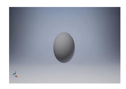
Figure FCV part 2.

It is rested in FCV outer body and plays the key role in FCV by making pressure drop and controlling flow. The return flow is stopped by this valve.