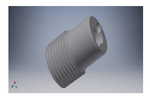
Figure FCV part 3.

This outlet insert contains the outlet connection of the valve to the pipe and fixed to the FCV outer body. It helps to stop the ball while the flow runs.