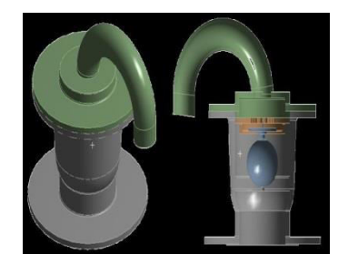
Fig : CAD model

In post-processor results obtained by the solver is read and interpreted. Animation and graph describe the effects in terms of deformation, pattern forms, and natural frequency. Stress obtained are analyzed by the stress plot which used know the maximum and minimum stress is present and by this we can conclude, weather the design is safe or not. Design modification can have carried out in those areas where the attention is required. It gives the representation of the stress, strain and deflection in any direction or in required direction also at any angle to the coordinate axis.