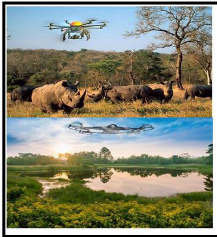
Fig.4. A I image Autonomous Drones