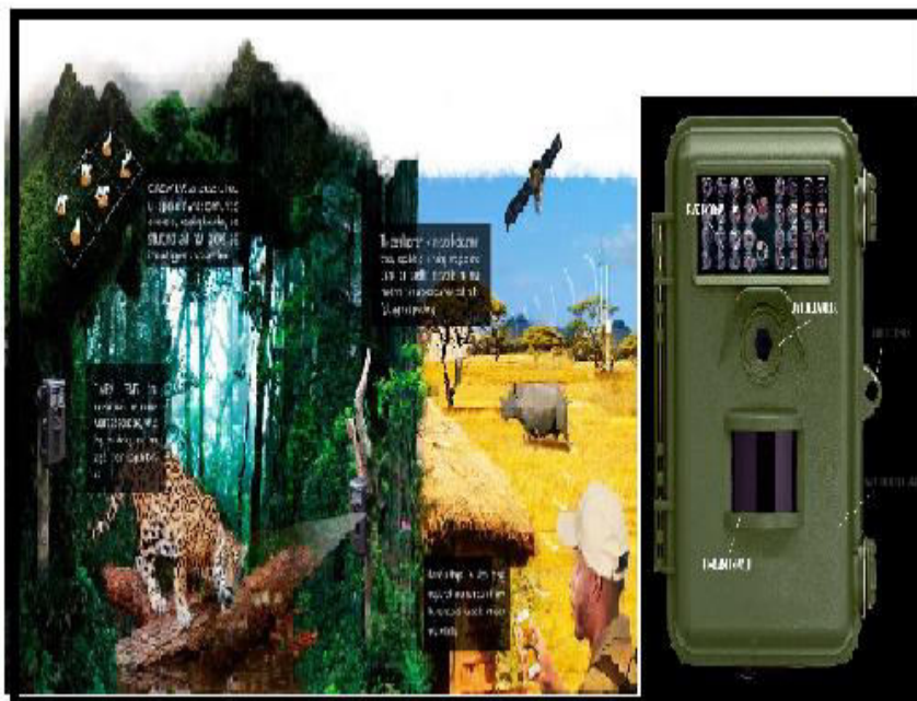
Fig.1. Camera Traps & Image