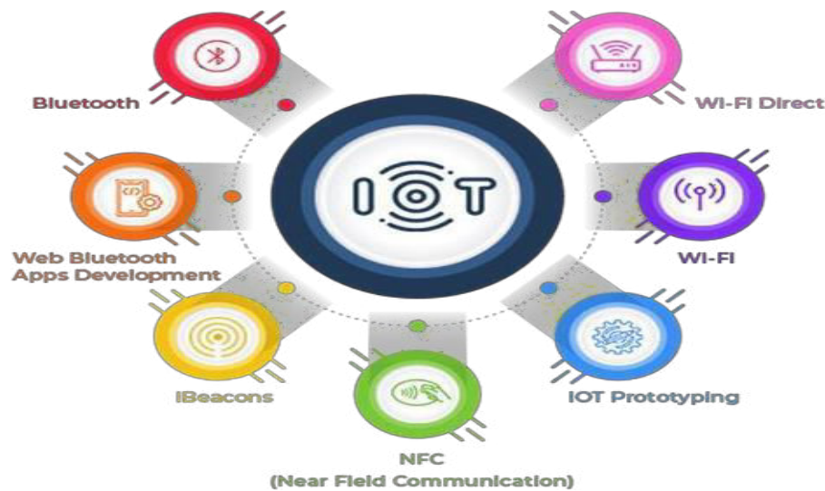
Diagram 2: IoT and Its Impact On Software Development

From smart homes and connected vehicles to industrial automation and healthcare systems, IoT has permeated virtually every aspect of modern life, creating new opportunities and challenges for software developers worldwide. This paper aims to provide a comprehensive overview of the impact of IoT on software development practices, shedding light on emerging trends, innovative solutions, and future prospects in this rapidly evolving domain.