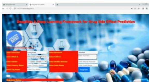
Figure 4.1 Drug side effects prediction page

We obtained notable increases in predicting accuracy by using the LINCS L1000 dataset and a multi-modal method. Accuracy of the model was increased by the combination of drug chemical structure and gene expression data, which offered a comprehensive picture of pharmacological effects. The better performance of the CNN model using SMILES strings emphasises even more how useful deep learning methods are in this field. The pharmaceutical industry will benefit much from our results, which provide a potent instrument for early risk assessment and direction of the medication design process. Deepside may help to produce safer and more efficient medications, which will eventually help patients as well as developers by enhancing the prediction of adverse effects from medications.