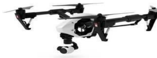
Figure 6: DJI T600 Inspire 1

Agras MG-1- DJI: The Agras MG-1 from DJI is the best octocopter for farmers to use for spraying herbicides, insecticides, or fertilisers across vast tracts of farmland. The MG-1's ability to transport liquid payloads up to 10KG and its capacity to cover an area of 400–6000 m 2 in under 10 minutes—70 times faster than hand spraying—are its unique features. To maintain airflow to all the drone's components while in flight, the MG-1 includes a totally sealed fuselage and an effective, integrated centrifugal cooling system. For precise fertiliser application in the field, the MG-1 is outfitted with four nozzles. It also has three flight modes: Smart, Manual Plus Mode, and Manual Mode, each of which is customized to the specific needs of the field. Without the utilization of any additional equipment, MG-1 has a Y-type folding structure [3]. As depicted in the figure 7.