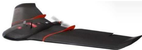
Figure 8: EBEE SQ-SenseFly