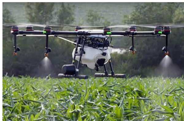
Figure 2: Crop Spraying

A contemporary technique for applying insecticides, herbicides, and applying fertilizers to crops using unmanned aerial vehicles is called crop spraying. In comparison to conventional ground-based techniques, this technology offers a number of benefits, including improved accuracy, speed, safety, and accessibility. Using drones, farmers can swiftly and effectively cover enormous areas, using fewer pesticides and having less of an impact on the environment. Regulation limitations and a payload capacity ceiling are two issues with drone-based crop spraying, though. Yet, this technology holds great promise for enhancing crop management, lowering labour costs, and raising agricultural productivity. As depicted in the figure 2.