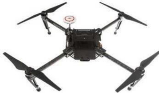
Figure 5: DJI Matrice 100