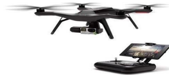
Figure 9: SOLO AGCO Edition