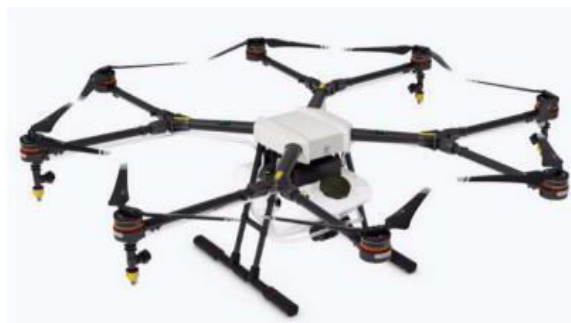
Figure 7: Agras MG-1- DJI

Agras MG-1- DJI: The Agras MG-1 from DJI is the best octocopter for farmers to use for spraying herbicides, insecticides, or fertilisers across vast tracts of farmland. The MG-1's ability to transport liquid payloads up to 10KG and its capacity to cover an area of 400–6000 m 2 in under 10 minutes—70 times faster than hand spraying—are its unique features. To maintain airflow to all the drone's components while in flight, the MG-1 includes a totally sealed fuselage and an effective, integrated centrifugal cooling system. For precise fertiliser application in the field, the MG-1 is outfitted with four nozzles. It also has three flight modes: Smart, Manual Plus Mode, and Manual Mode, each of which is customized to the specific needs of the field. Without the utilization of any additional equipment, MG-1 has a Y-type folding structure [3]. As depicted in the figure 7.