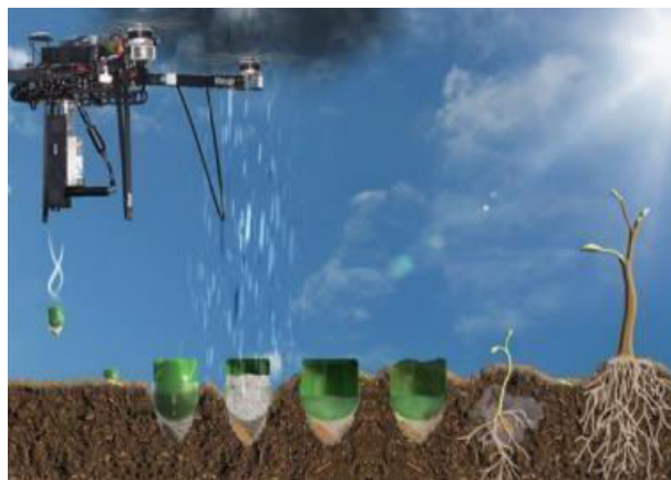
Figure 3: Planting Crops

Drones can also access locations that are challenging to access, including steep hills or flooded fields, enabling more thorough planting. While drone planting technology is still under development, it holds the potential to completely change how we plant crops and manage our property. Drones can be connected with other technology to give farmers data- driven insights into their land, crops, and resource management. As shown in the figure 3.