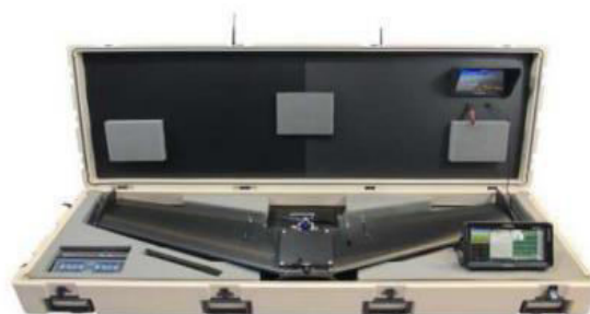
Figure 4: Honeycomb AgDrone System

composite of Kevlar Fiber, the same material used in bulletproof jackets, making it resilient, adaptable, and powerful for agriculture in all environments [3]. As depicted in the figure 4.