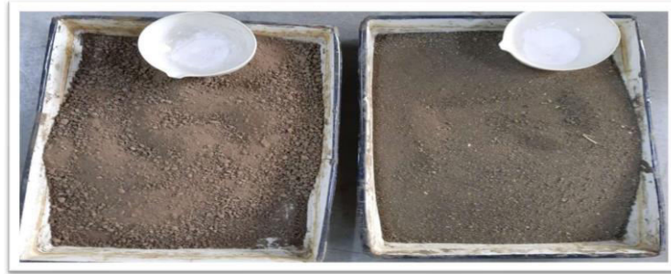
Fig. 2 Soil Sample