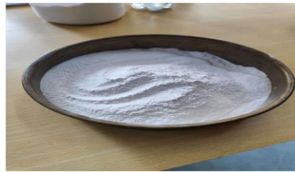
Fig. 3 Marble Powder

Marble was obtained from an industry factory at Kadakola, Mysore. Then the stones were crushed into powder in the Ministry of Minerals. The chemical composition of Marble Powder is shown in Table 1.