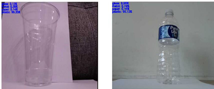
Fig 4: Results of the recycling material classification