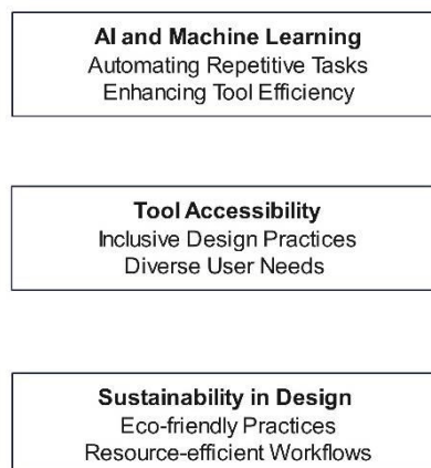
Figure 5: Future Directions in UI-Based Tools

Future research should explore emerging trends in UI-based tools, including their contributions to enhancing accessibility, sustainability, and personalized user experiences. Additionally, examining the intersection of design systems and UI frameworks can provide insights into optimizing design consistency and scalability across diverse web projects.