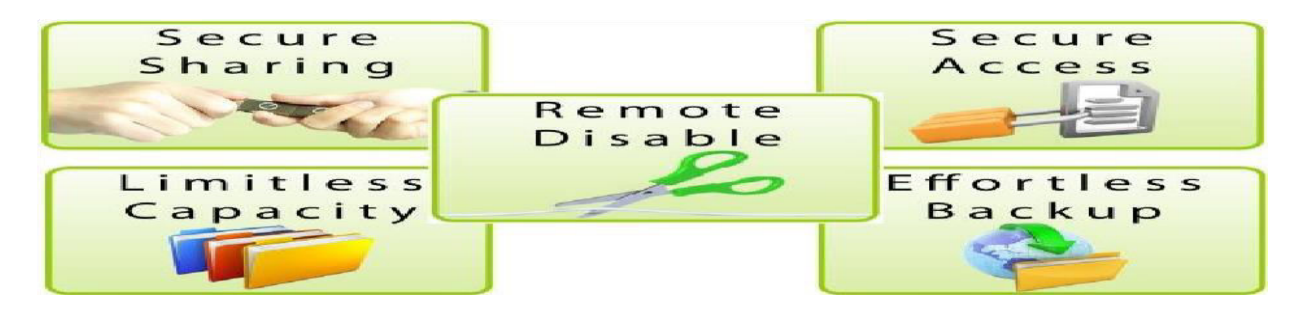
Fig. 2. iTwin Features