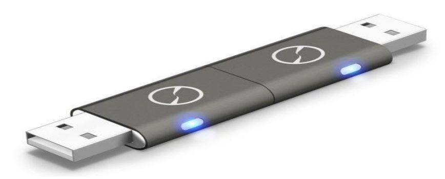
Fig 3. iTwin Device

The majority of professionals and individuals who are constantly on the go and wish to have access to their files and information regardless of their location choose cloud services to store and backup critical documents. Accessing your data from any device with an Internet connection is possible with a cloud service. Security solutions are widely used by cloud service providers to ensure that their clients' data are sent and kept securely. However, since nothing is flawless, a gadget like iTwin Connect can assist you in covering all of your bases in the event of a data loss or disruption. The iTwin Connect gadget ensures the privacy and security of your files. Since you are the owner of the device, it only works when connected to a computer; it has military-grade security, two-factor authentication, and does other tasks that we have covered in this article. Your data and records are safe even if you keep the primary computer running so you can access it from anywhere.