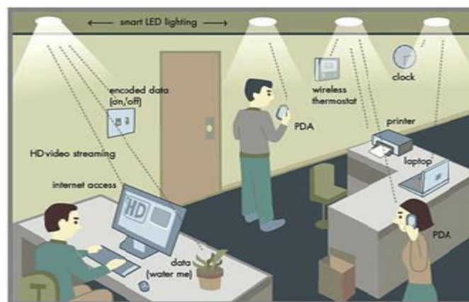
Fig. 1: Li-Fi environment