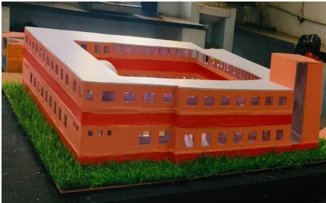
Fig (a): Model work

Figures shows the results of rainwater harvesting system for Bahubali college of engineering shravanabelagola , Hassan , Karnataka.