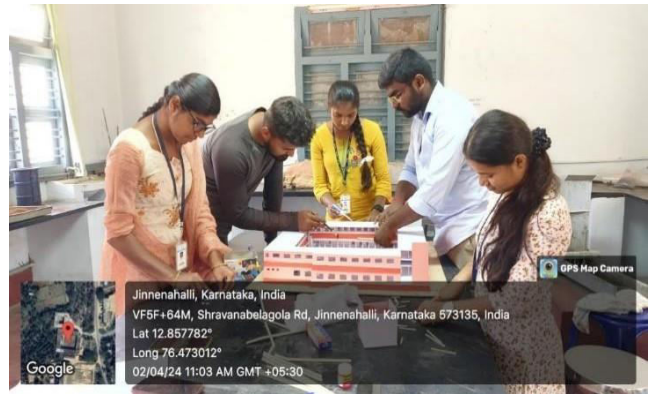
Fig (b): Working model