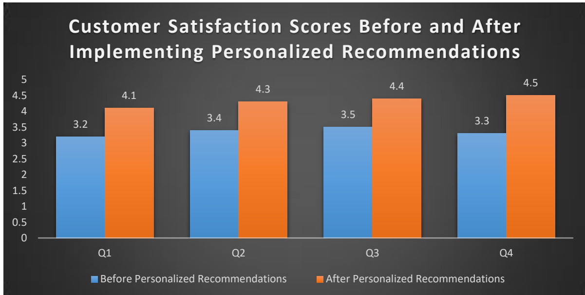
Figure 1: Customer Satisfaction Scores Before and After Implementing Personalized Recommendations [5]