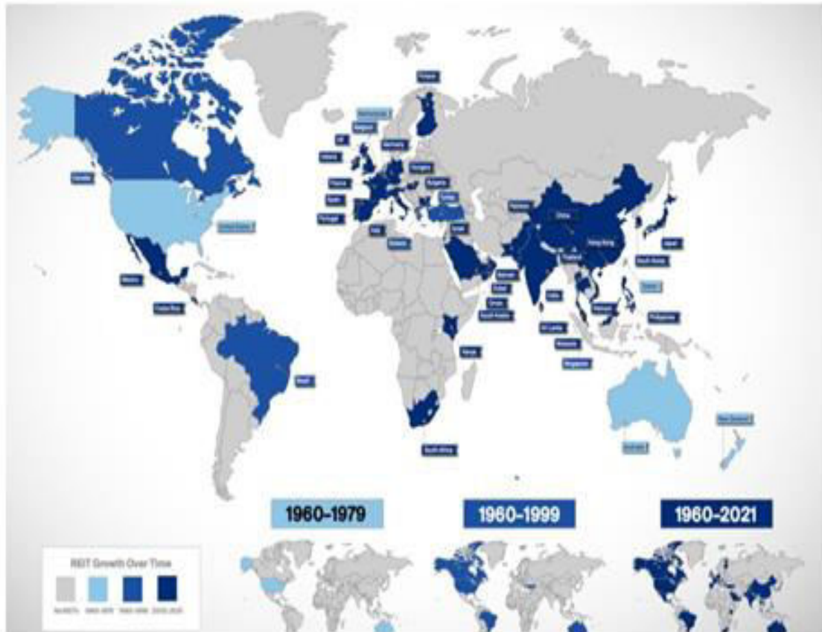
Figure: Countries and regions with REITs; Source: (Funari, 2022) Understanding the performance level of Real Estate Investment Trusts in Emerging markets:

Khan and Siddiqui (2019) discuss the traction REITs have gained in emerging markets, offering investors significant opportunities and challenges compared to developed markets. The Global Real Estate Transparency Index indicates that the total value of listed REITs in emerging markets reached $20 billion in 2020, underscoring their expanding role as a viable investment strategy (Funari, 2022).