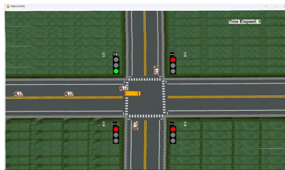
Fig2-Traffic Light -1