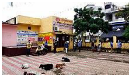
An Urban Primary Health Centre under Ayushman Bharat Yojana in Bidipeth, Nagpur

ABSTRACT: Ayushman Bharat Pradhan Mantri Jan Arogya Yojana (PM-JAY; lit. 'Prime Minister's People's Health Scheme', Ayushman Bharat PM-JAY lit. 'Live Long India Prime Minister's People's Health Scheme') is a national public health insurance scheme of the Government of India that aims to provide free access to health insurance coverage for low income earners in the country. Roughly, the bottom 50% of the country qualifies for this scheme. [2] People using the program access their own primary care services from a family doctor and when anyone needs additional care, PM-JAY provides free secondary health care for those needing specialist treatment and tertiary health care for those requiring hospitalization. [3]