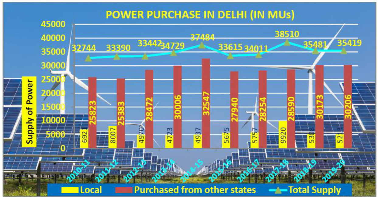
Fig. 3 Power Purchase in Delhi (IN MUs) (Ref- Delhi Statistical Handbook and power department)

In today's era the major concern is about the increase in demand of electricity to fulfill the requirements in the various sectors like Agriculture, Industrial, Commercial as well as Residential Buildings. In 2018-19 buildings in residential sectors consumed about 24% of India's Electrical Energy, primarily for HVAC, lighting and ceiling fan. India's developmental challenge becomes further convoluted with priority towards 24 X 7 electricity access to its 1.3 billion citizens. Other domestic initiatives like 'Make in India', and the 'National Housing Mission' (NHM) are also expected to further increase the demand for energy in industrial and buildings sectors.