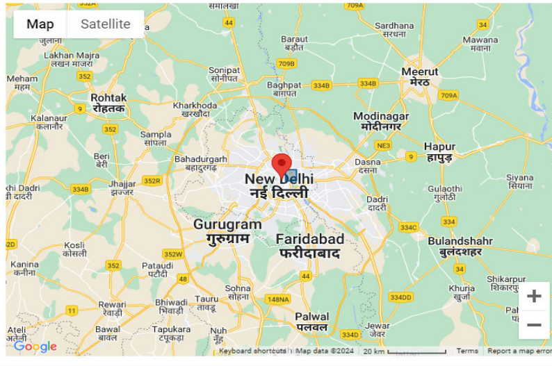
Fig. 4 Site Selection for the solar roof top analysis