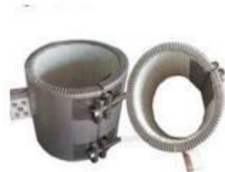
Figure 5: Band heater

4. Band heater: A coil is a heating element integrated within the heating unit. The heater generates electric current, which is then transferred to the coil. The heating coil converts electrical energy into heat energy. It can either directly immerse in a medium to heat it or radiate heat into an open space.