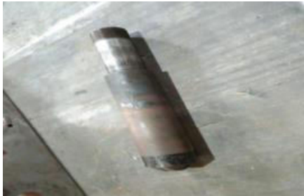
Figure 2: Barrel