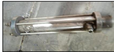
Figure 4: Injection hydraulic cylinder

3. Injection hydraulic cylinder: Hydraulic cylinders are devices that utilize pressurized hydraulic fluid to generate linear motion and force. They find application in various power transfer tasks and can operate as single or double action mechanisms.