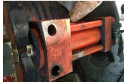
Figure 3: Clamping hydraulic cylinder

3. Injection hydraulic cylinder: Hydraulic cylinders are devices that utilize pressurized hydraulic fluid to generate linear motion and force. They find application in various power transfer tasks and can operate as single or double action mechanisms.