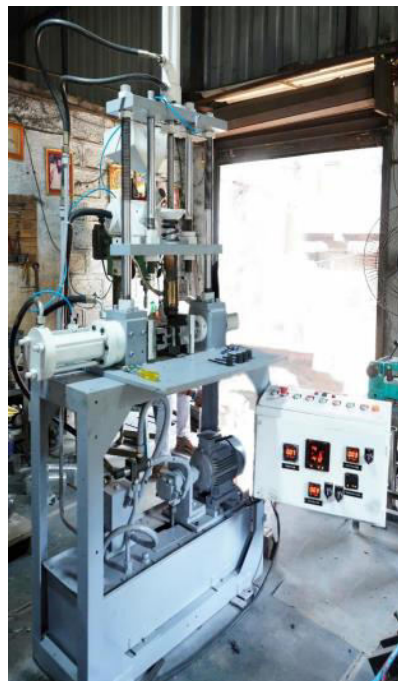
Figure 7: Final Hardware