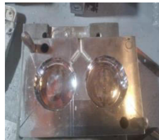
Figure 6: Plastic die mould

5. Plastic die mould - In the plastic die mould, a nozzle is employed to feed the melted plastic material into the die. Positioned at the end of the barrel, the nozzle facilitates the passage of melted material from the barrel into the mould. Shown in figure 6.