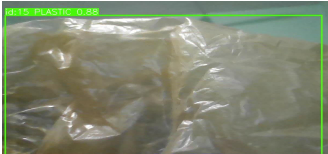
Fig 3 : Plastic Identified in Realtime