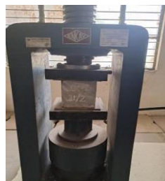
(a) Compressive strength testing

The compressive strength test is a fundamental measurement in material science and engineering used to assess the ability of a material to withstand axial compressive forces. It's particularly crucial in construction, civil engineering, and manufacturing industries where materials like concrete, metals, plastics, and composites are involved. Compressive test is held on the universal testing machine of 2000KN. The test is held on the 7,14 and 28 days. Compressive strength test is done as Per IS 516- 1959[15].