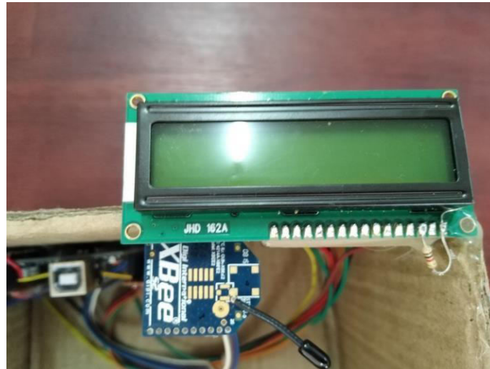
Fig 5.2 Display in Trolley