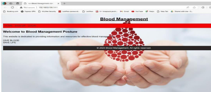
FIG.1: BLOOD MANAGEMENT SYSTEM HOME PAGE

Our comprehensive Blood Management System is designed to streamline the management of blood supply chains, ensuring efficient distribution, tracking, and utilization of life-saving resources. Utilizing a full stack approach, our system integrates cutting-edge technologies to provide a seamless user experience and optimize operational workflows.