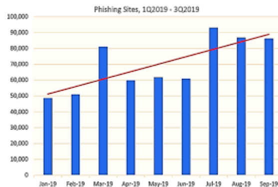
Fig2: Result Analysis

not use the normal web page. Based on the correlation of all the features about the attacker can be extracted before the training and classification phase. The features are extracted based on the domain and HTTP address and many features are considered. Based on all the features of the attackers. The advantage of this approach is time consumption and used in dynamic user account creation not only static user creation. This concept is based on the analysis of the language used in each tweet, to identify those messages whose purpose is to divert traffic from legitimate users to spam websites. The proposed system using supervised learning algorithm to detect the attackers. This system quickly detects the attackers and it consumes very less time compared to the existing system.