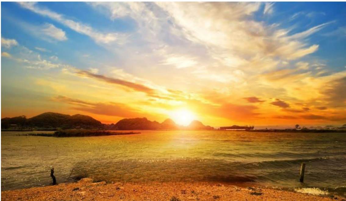
Fig. 4.0 After inpaint