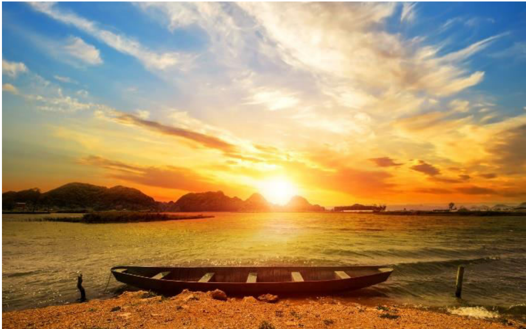
Fig. 3.0 Before inpaint