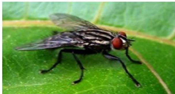
Fig.: Sarcophaga africa