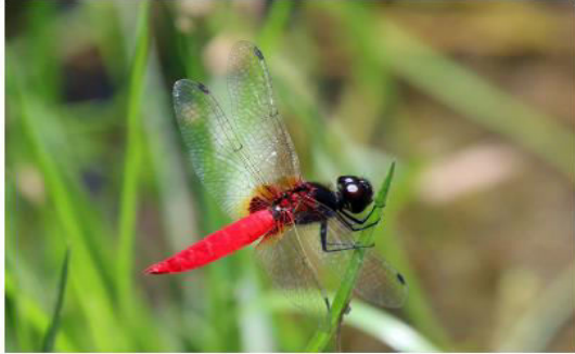
Fig.: Rhyothemis variegata