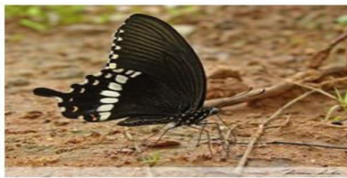
Fig.: Papilio polymnestor