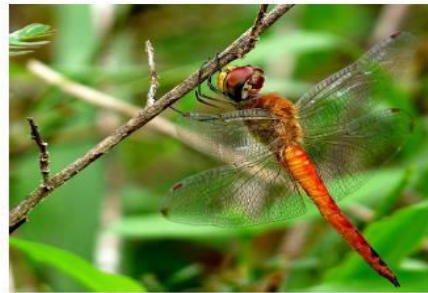
Fig.: Pentalis flevescens