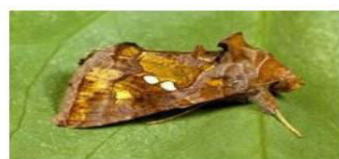
Fig.: Chrysodeixis chalcites