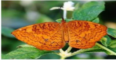
Fig.: Ariadne merione