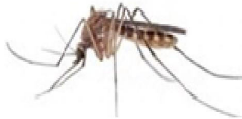
Fig.: Culex quanquefasciatus