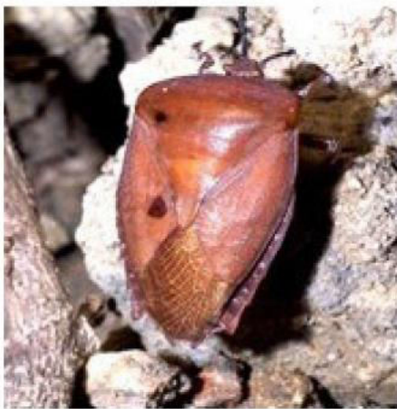
Fig.: Tessaratomia papillosa