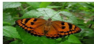
Fig.: Symphoedra nais