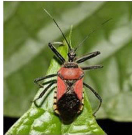
Fig.: Gonopsis coccinea