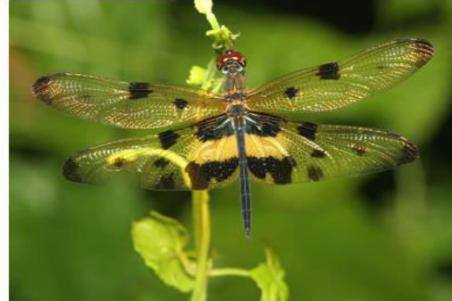
Fig.: Zyxomma petiolatum