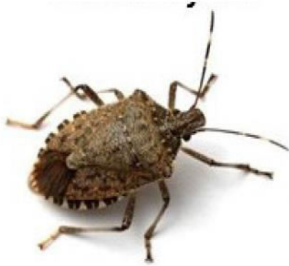
Fig.: Halyomorpha halys