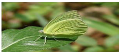
Fig.: Catopsilia pomona