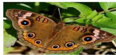
Fig.: Junonia lemonias