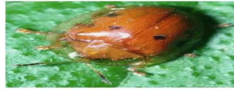
Fig.: Charidotella sp