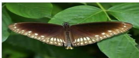
Fig.: Euploea core