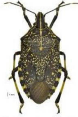
Fig. : Erthesino fullo