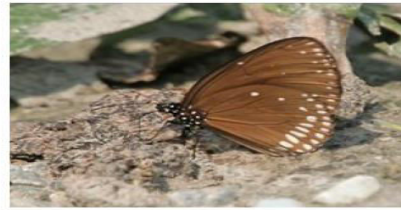
Fig.: Euploea mulciber