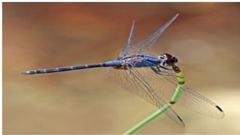
Fig.: Trithemis festiva