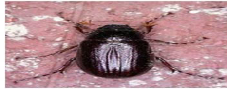
Fig.: Phyllophaga sp