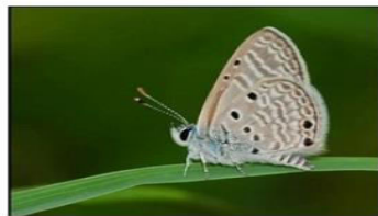
Fig.: Azanus ubaldus