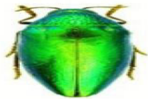
Fig.: Sternocera ruficornis