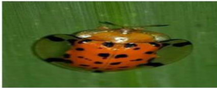
Fig.: Aspidomorpha milliaris