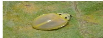
Fig.: Illies cincata