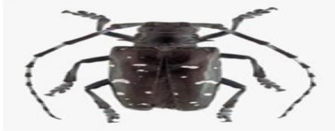
Fig.: Anoplophora glabripennis