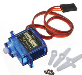
Fig. 1 Servo Motor

Servomotors are not a specific class of motor, although the term servomotor is often used to refer to a motor suitable for use in a closed-loop control system. Servomotors are used in applications such as robotics, CNC machinery, and automated manufacturing.