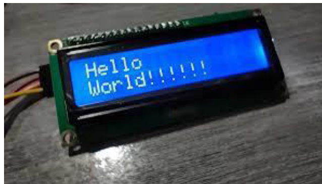
Fig 2. Liquid Crystal Display(LCD)

A liquid-crystal display (LCD) is a flat-panel display or other electronically modulated optical device that uses the light-modulating properties of liquid crystals combined with polarizers. Liquid crystals do not emit light directly [1] but instead use a backlight or reflector to produce images in color or monochrome[6]