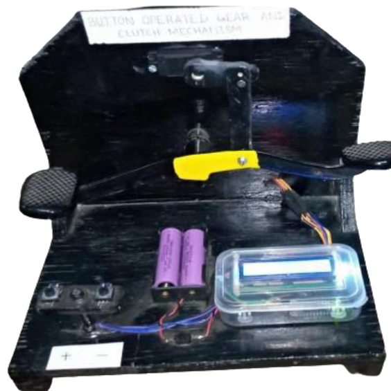
Fig 5 PROTOTYPE OF AUTOMATIC CLUTCH GEAR MECHANISM