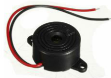
Fig. 3 Buzzer

The electric buzzer was invented in 1831 by Joseph Henry. They were mainly used in early doorbells until they were phased out in the early 1930s in favor of musical chimes, which had a softer tone[7]