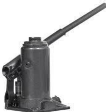
Fig 1: hydraulic jack

This kind of concept will be very useful in society, so our team interacted and questioned some types of peoples to know what are the problems that they are facing while their tyre gets punctured in certain circumstances. A lady stated that, if my car gets punctured, I face many difficulties and inconvenience. Also, she said that it is very difficult to operate lever bottle hydraulic jack or some any kind of mechanical jack. We also interacted with one car driver. He stated that “we are using cars for commercial purpose. so that the tyre quality will get depreciate day by day. Because of that many times car will get puncture at out of city limit areas and remote areas, on that time, it is very difficult to find workshops, mechanic shops. Many times, we changed the tyres in dark places. It will be very easy if any product is there for us to replace tyres in a faster and automated manner”. Our team visited some car garages and workshops to discuss that if they are having any devices, instruments or any ideas to rectify the above problem. Through this field survey our project team got some useful inputs for project ideas.