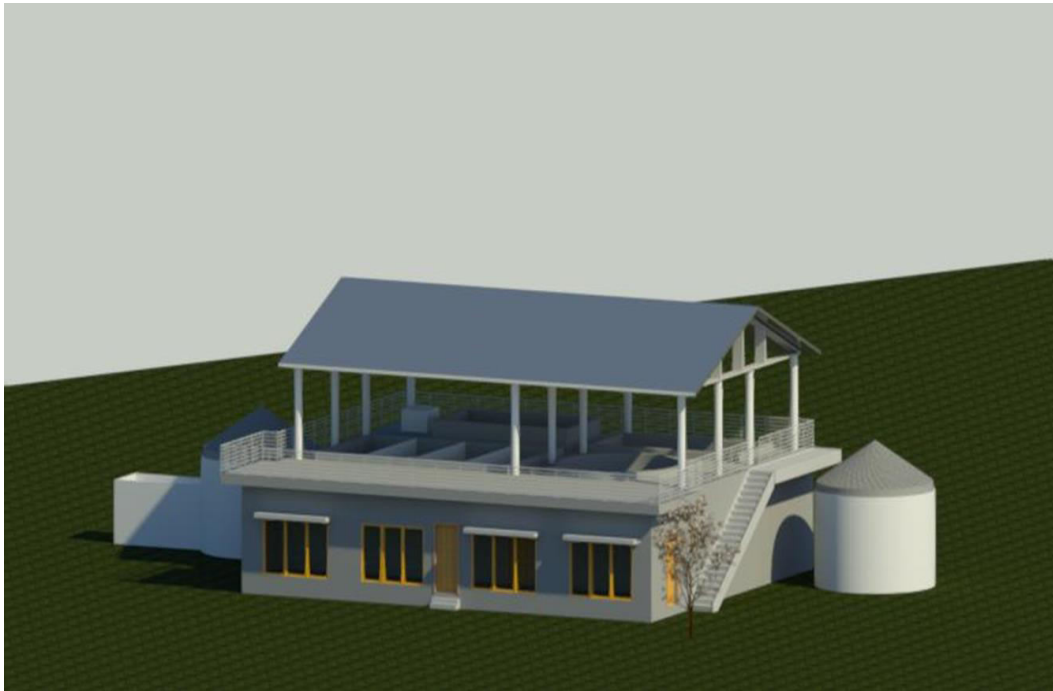
3D drawing of waste water treatment plant using Revit