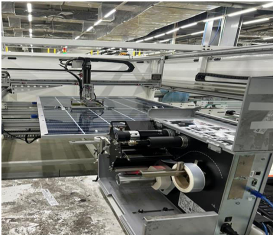
Fig. 1 Manufacturing of a solar panel

Fig. 2 shows that a Solar Photovoltaic (PV) cell works on the principle of photovoltaic effect, where sunlight is directly converted into electricity. The solar cell consists of semiconductor material, usually silicon which absorbs photons (particle from light) from sunlight [8]. When photons strike the semiconductor material, they can transfer their energy to electrons in the material, allowing them to break free from their atoms, creating electron-hole pairs. Due to the internal structure of the cell, these charge carriers are separated, with electrons moving towards the n-type layer and holes towards the p-type layer, which creates an electric field across the p-n junction. This electric field drives the flow of charge carriers generating electric current, after that the metal contacts which are present on the top and bottom of the solar cell collects that generated electricity by the movement of holes and electrons accordingly. The direct current (DC) electricity which is produced by the solar cell can be used to power electrical devices, stored in batteries for later use, or can be converted in alternating current (AC) by using an inverter for various applications including powering electrical devices etc. [8].