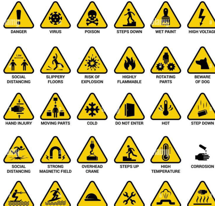
Fig (1). Electrical Safety Symbols