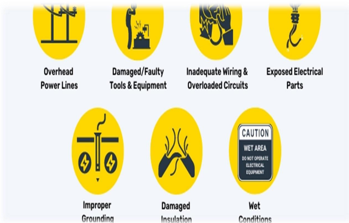
Fig (3). Electrical Hazards

There are several types of electrical hazards that can be encountered in colorful settings. There are several typical forms of electrical hazards, which include: