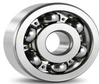
Fig 4.4 Ball Bearing

Bearings are mechanical components that reduce friction and facilitate smooth rotation of moving parts within the system. They support rotating shafts and ensure efficient operation of components such as the wind turbine rotor, generator, and other rotating machinery.