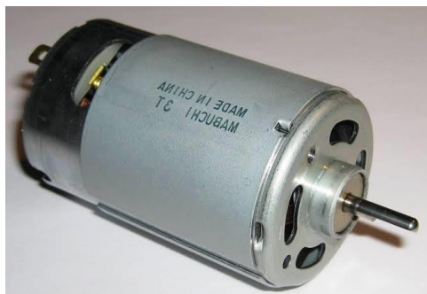
Fig 4.3 DC Generator

The DC generator is a device that converts mechanical energy into electrical energy in the form of direct current (DC). In a wind turbine system, it is driven by the rotational motion of the wind blades. It consists of coils of wire rotating within a magnetic field to produce electricity.