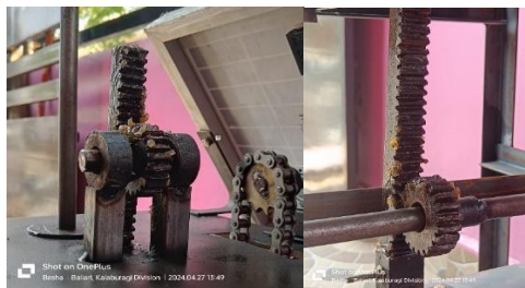
Fig 4.5 Rack and Pinion

The rack and pinion mechanism is a type of gear system used to convert rotational motion into linear motion. In the context of a renewable energy system, it may be used to adjust the angle of the solar panels to maximize sunlight capture throughout the day. The rack is a linear gear, and the pinion is a small gear that meshes with it to produce linear motion.