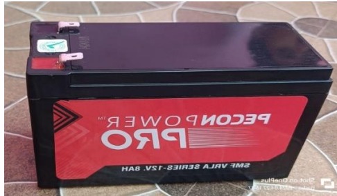
Fig 4.1 Rechargeable acid battery

1. The battery is a crucial component for storing excess electrical energy generated by the system. It typically consists of one or more rechargeable cells and serves as a buffer to balance supply and demand. Batteries ensure a continuous power supply during periods of low wind or solar activity and can also provide backup power during grid outages.