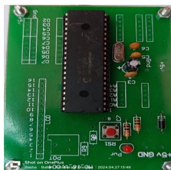
Fig 4.6 Microcontroller

The PIC microcontroller is a small, programmable computer chip that serves as the control center of the renewable energy system. It is programmed to monitor and control various functions such as system performance, power output optimization, safety features, and communication with external devices or the grid. The microcontroller may regulate voltage, control the operation of the inverter, manage battery charging and discharging, and implement other control strategies to maximize the efficiency and reliability of the system.