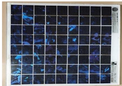
Fig 4.2 solar panel

1. Solar panels consist of photovoltaic (PV) cells that convert sunlight directly into electricity through the photovoltaic effect. They are typically made of silicon-based semiconductors and are mounted on a frame to form a solar array. Solar panels complement wind energy generation by providing power during daylight hours and in sunny conditions.