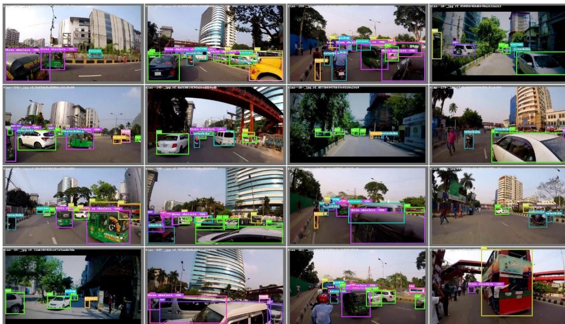
Fig 6.1 Traffic density insights 1