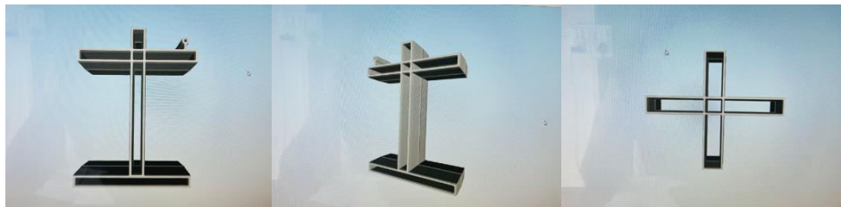
Fig3. Front view (3D) 4. Side view (3D) 5. Base top view (3D)

3D drawings offered a detailed view of the tool from multiple angles, ensuring all components were correctly aligned and integrated.