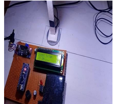
FIG 4: Location of the pole 3