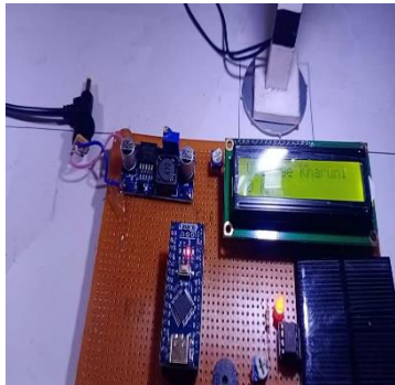
FIG 2: Location of the pole 1