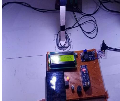
FIG 3: Location of the pole 2