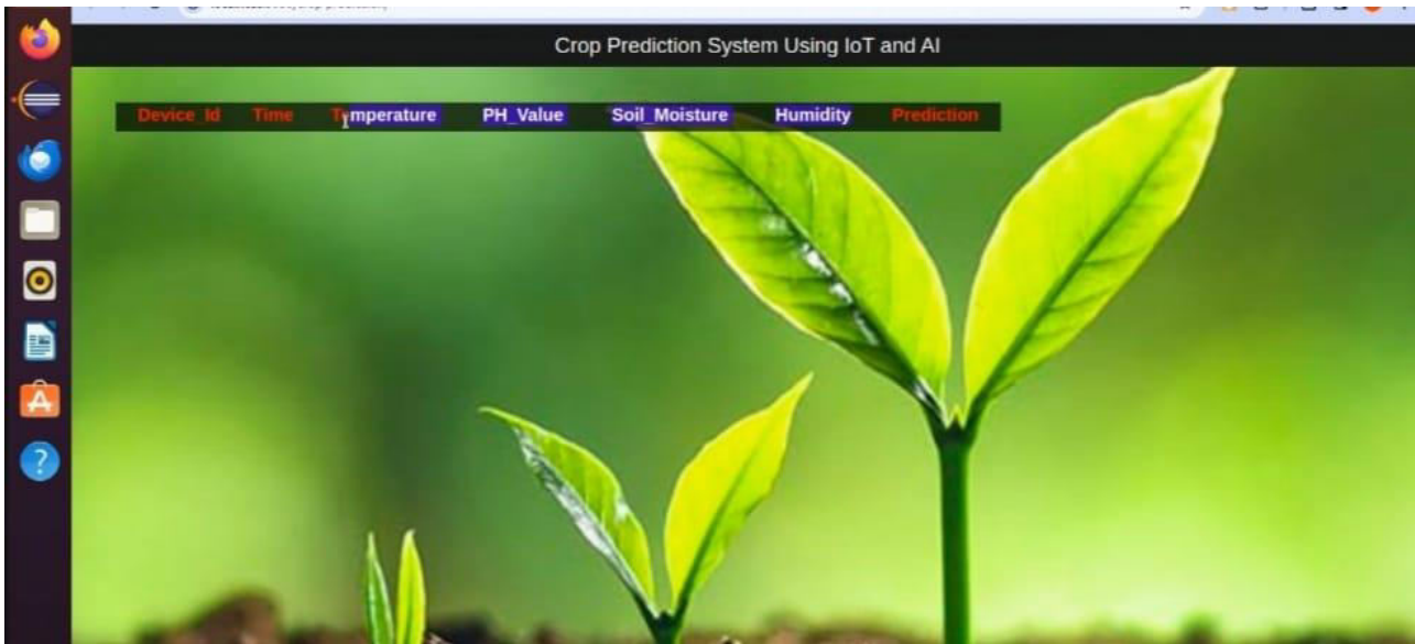
Fig 3: The front-end of the crop prediction

A user-friendly interface for the website is developed to visualize real-time sensor data and provide actionable insights to farmers. The UI is seamlessly integrated with decision support systems, enabling farmers to receive real-time recommendations based on sensor data analysis.