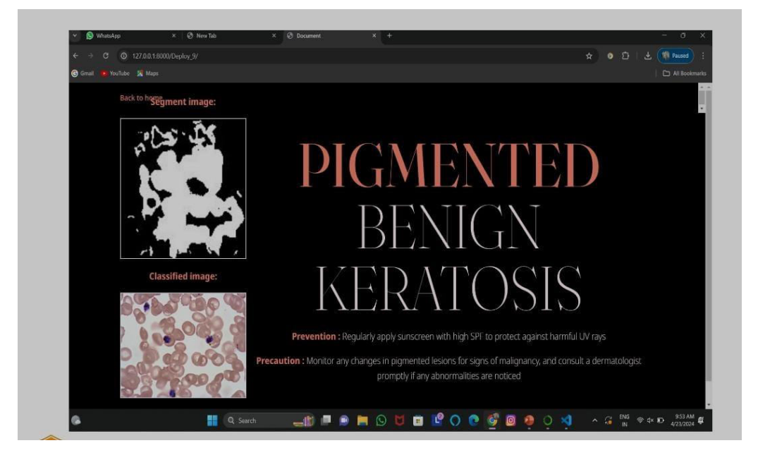
Fig: Output 2