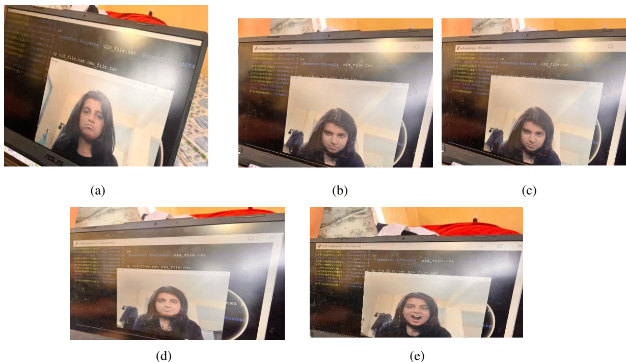
Fig. 2. Input Image(to capture different emotions)

The overall mental stress prediction system outperformed the baseline, highlighting the value of incorporating facial analysis. However, the qualitative analysis revealed that the system could still struggle with subtle or masked expressions, suggesting the need for additional modalities or more advanced techniques.