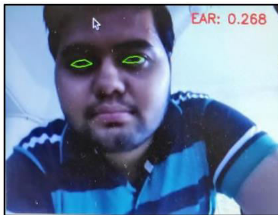
Fig: 3 Normal Face

Results and analysis are provided in this segment. The key results of the Haar Cascade algorithm and the EAR formula are analysed on the basis of the various experimental studies. The EAR was determined on the basis of the equation (4) for each consecutive video frame and the EAR threshold was set in the code. The numerator of this equation calculates the distance between vertical eye landmarks while the denominator calculates the distance between horizontal eye landmarks. The EAR values for both eyes were then determined and the average EAR values for both eyes were shown on the screen. As described above, when eyes closed, the EAR result would be approximately 0 while, when eyes open, the EAR is always any number that is greater than 0. Figure 11 demonstrates the real-time measurement of the EAR during open and closed eyes. It is also seen that the EAR value appeared on the screen as seen in Figure which was 0.268 when the eyes opened (not drowsy). Meanwhile, the EAR value was small (0.127) when the eyes closed (indicate sleepiness). The notification of drowsiness warnings is also shown in Figure.