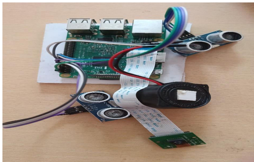
Fig: 2 Raspberry Pi 3

It is capable of capturing 3280 x 2464 pixel images and support 1080p30, 720p60 and 640x480p60/90 videos. Its small size and light (with a weight of just over 3 g) make it suitable for portable applications. It can be connected to the Raspberry Pi via a short ribbon cable.