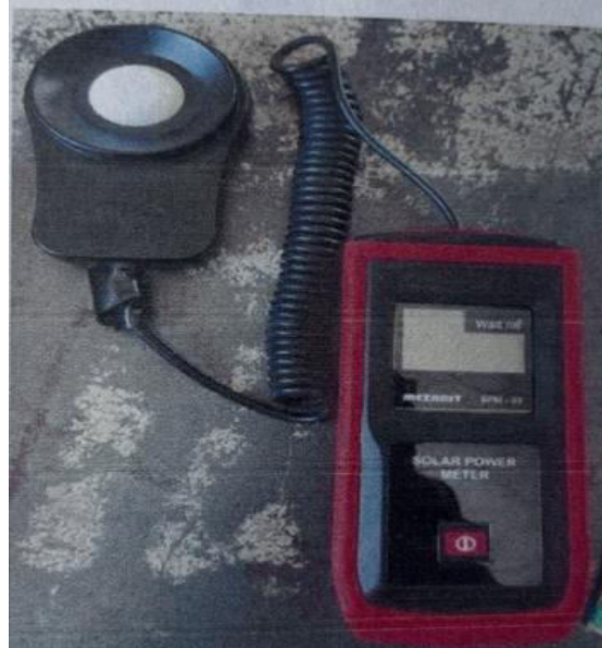
Fig : Solar Power meter

A solar power meter is a device that can measure solar power or sunlight in units of W/m^2 , either through windows to verify their efficiency or when installing solar power devices. Solar meters accumulate PV yield production and local energy consumption to monitor and analyse PV plant performance.