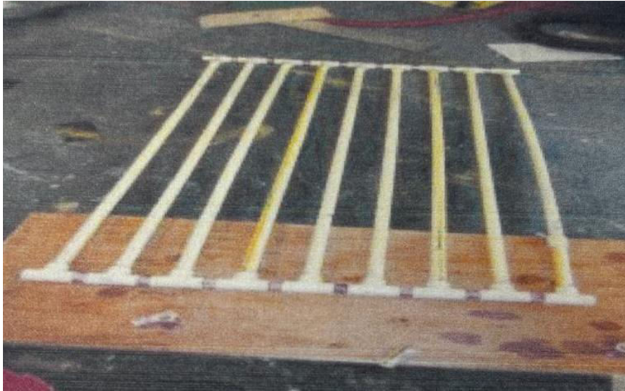
Fig :Flow passage ( CPVC Pipes )

The flow passages conduct the working fluid through the collector. If the Working fluid is a liquid, the flow passage is usually a tube that is attached to or is a part of absorber plate. If the working fluid is air, the flow passage should be below the absorber plate to minimize heat losses. The flow passages here we used is CPVC Pipes.