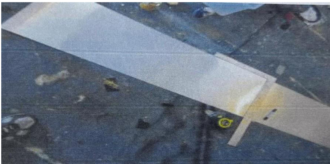
Fig : A Flat Plate Absorber (Aluminum)