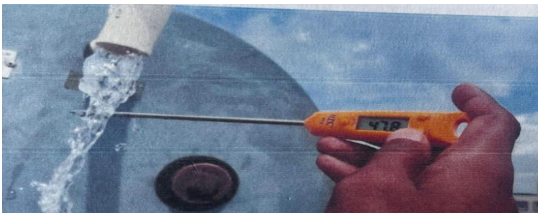
Fig : Thermometer