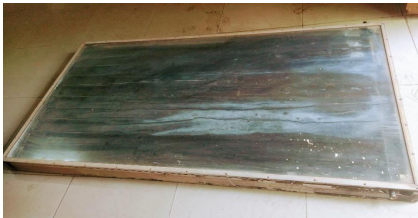
Fig: CPVC collector

A CPVC pipes used to make collector fig is CPVC flat plate collector to absorb the heat with black coated.