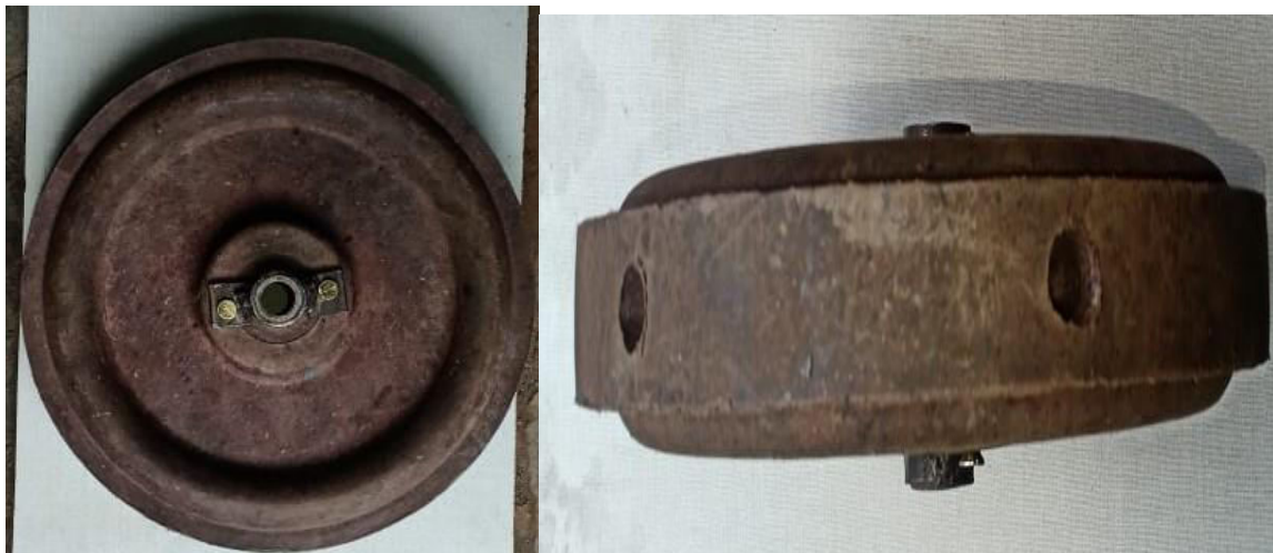
Fig: Seed Dispenser wheel

5. Seed Dispenser wheel: An agricultural tool called a seed dispenser is used to plant seeds for crops by placing them in the ground and burying them to a predetermined depth. This guarantees that seeds will be dispersed uniformly. Seed hole dia 15 mm (for ground nut seed).