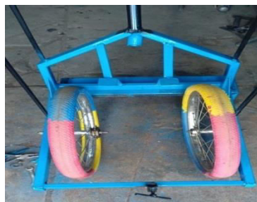
Fig: Ground Wheel

3. Ground Wheel: A pair of idler wheels on either side aid in the precise adjustment of seed placing depth while the ground wheel supplies the necessary power for the seed metering mechanism to function. To raise and lower the ground wheel during turns, a lever mechanism is also available. The tool is easily towed by a pair of bullocks. Mild steel is used for the grinding wheel. The seed metering mechanism and ground wheel are connected and are located at the box's base. Seed metering is the process that extracts seeds from the seed box and places them in the seed tube.