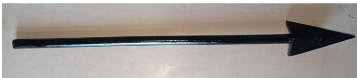
Fig: - Plough

6. Plough: A plough is a farm instrument used to turn or soften the soil before to planting or spreading seeds. Traditionally, horses and oxen pulled the plough. A blade linked to a wooden, iron, or steel frame is what a plough uses to cut and loosen dirt. It has been essential to farming for the majority of time. Ploughs are primarily used to turn over the top soil, bringing new nutrients to the surface while burying weeds and crop residue for later decomposition.