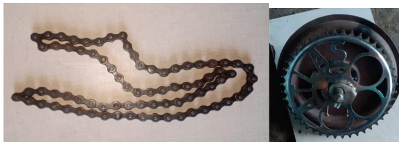
Fig: Chain & Sprocket

2. Chain & sprocket: The type of chain drive most frequently used for mechanical power transmission on a variety of home, industrial and agricultural machinery, including conveyors, wire- and tube-drawing machines, printing presses, cars, motorcycles and bicycles, is roller chain or bush roller chain. It is made up of several short cylindrical rollers connected by side links. It is propelled by a sprocket, a wheel with teeth. It is a straightforward, dependable, and effective method of transmitting power. Tensile strength is the most popular way to assess the toughness of roller chains. A chain's tensile strength indicates how much strain it can sustain before bending under a single load. The fatigue strength of a chain is as crucial to tensile strength