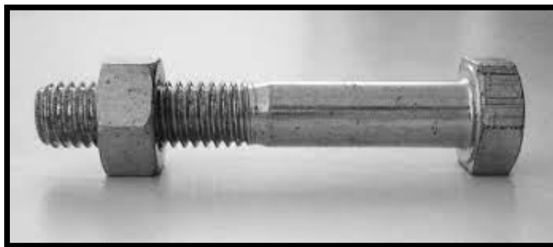
Fig:- Bolt and nut

Bolts are often used to make a bolted joint. This is a combination of the nut applying an axial clamping force and also the shank of the bolt acting as a dowel, pinning the joint against sideways shear forces. For this reason, many bolts have a plain unthreaded shank (called the grip length) as this makes for a better, stronger dowel. The presence of the unthreaded shank has often been given as characteristic of bolts vs. Screws, but this is incidental to its use, rather than defining. A nut is a type of fastener with a threaded hole. Nuts are almost always used in conjunction with a mating bolt to fasten multiple parts together. The two partners are kept together by a combination of their threads' friction (with slight elastic deformation), a slight stretching of the bolt, and compression of the parts to be held together. In applications where vibration or rotation may work a nut loose, various locking mechanisms may be employed: lock washers, jam nuts, specialist adhesive thread-locking fluid such as Loctite, safety pins (split pins) or lockwire in conjunction with castellated nuts, nylon inserts (nyloc nut), or slightly oval-shaped threads.