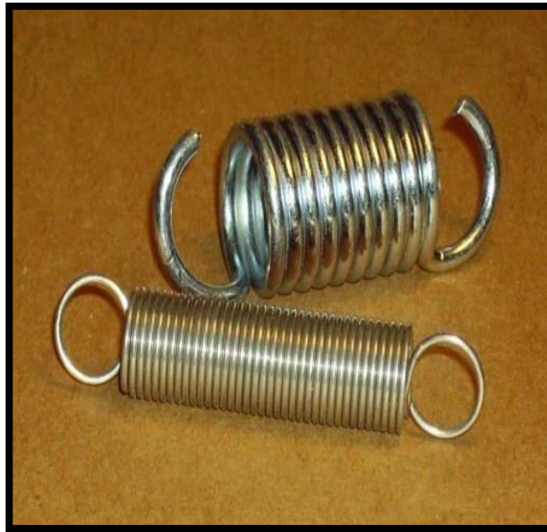
Fig : Spring