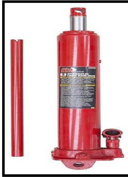
FIG :- HYDRAULIC JACK