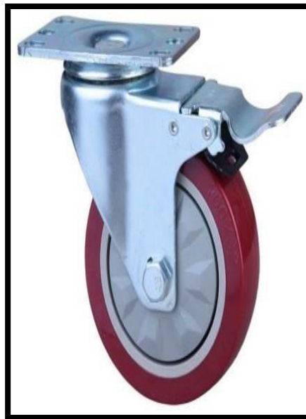
FIG:- ROTATING WHEEL

This project is about 360-degree rotating wheel. This wheel moves in all directions and this design provides better comfort and also saves the time, most of the people uses this vehicle to carry goods, emergency patients etc. The normal wheel face lot of problems like parking, U turn and much more which consumes more time. So, we have designed a 360-degree wheel rotating vehicle to reduce and eliminate problems in the industry as well as common life of people. The vehicle can take a turn without moving the wheel. No extra space is required to turn the wheel. In this system, each of the 4 wheels has given drive with DC motors, so it can rotate 360 degree. 360-degree rotating wheel is controlled by RF remote. Consequently, we can utilize this 360-degree rotating vehicle from various perspectives like to transport things overwhelming bags and furthermore in vehicles, which will help in decreasing rush hour gridlock and spare time.