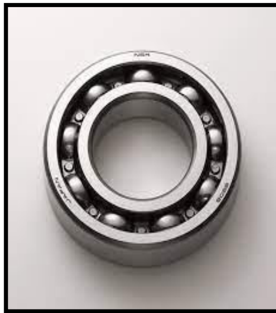
FIG :- BEARING

A bearing is a machine element that constrains relative motion to only the desired motion, and reduces friction between moving parts. The design of the bearing may, for example, provide for free linear movement of the moving part or for free rotation around a fixed axis; or, it may prevent a motion by controlling the vectors of normal forces that bear on the moving parts. Most bearings facilitate the desired motion by minimizing friction. Bearings are classified broadly according to the type of operation, the motions allowed, or to the directions of the loads (forces) applied to the parts. Rotary bearings hold rotating components such as shafts or axles within mechanical systems, and transfer axial and radial loads from the source of the load to the structure supporting it. The simplest form of bearing, the plain bearing, consists of a shaft rotating in a hole. Lubrication is used to reduce friction. In the ball bearing and roller bearing, to reduce sliding friction, rolling elements such as rollers or balls with a circular cross-section are located between the races or journals of the bearing assembly. A wide variety of bearing designs exists to allow the demands of the application to be correctly met for maximum efficiency, reliability, durability and performance.