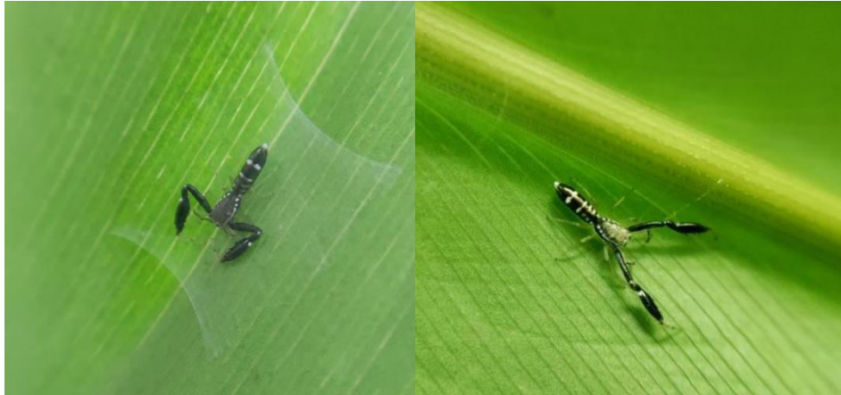
Ligdus garvale in its retreat (left) and Ligdus garvale on the torch ginger leaf (right)

Special note : A new species “ Ligdus garvale ” is also a spider from the study area. This Balline spider was noticed in a retreat of double layered web under a leaf of an introduced exotic torch ginger plant. Representing the rediscovery of the genus Ligdus after 129 years since its establishment, through the description of a new species from Karnataka state, India, the genus is reported for the first time in India [7].