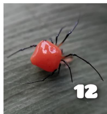
1.Cyclosa sp, 2.Agriope pulchella, 3.Pistius sp, 4.Marengo zebra, 5.Thiania bhamoensis, 6.Macracantha hasselti, 7.Romphia sp, 8.Africactinus sp, 9.Araneus viridiventris,10. Epidius sp, 11.Rhene sp 12.Chryso sp.