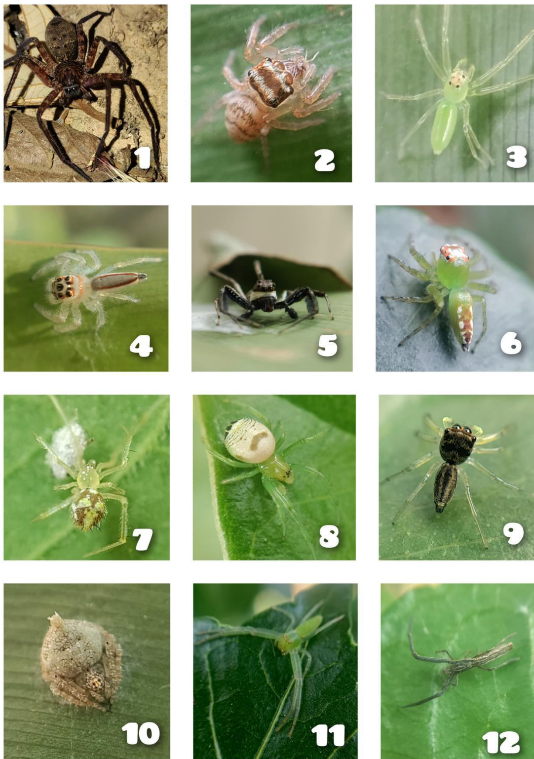
1.Heteropoda venatoria, 2.Ghatippus paschima, 3.Hindumanes karnatakensis, 4.Telamonia dimidiata, 5.Brittus cingulatus, 6.Epeus indicus, 7.Chrysso sp, 8.Arneus mitificus, 9.Foliabitus sp, 10.Eriovixia laglaizei, 11.Lycopus sp, 12.Miagrammopes sp.